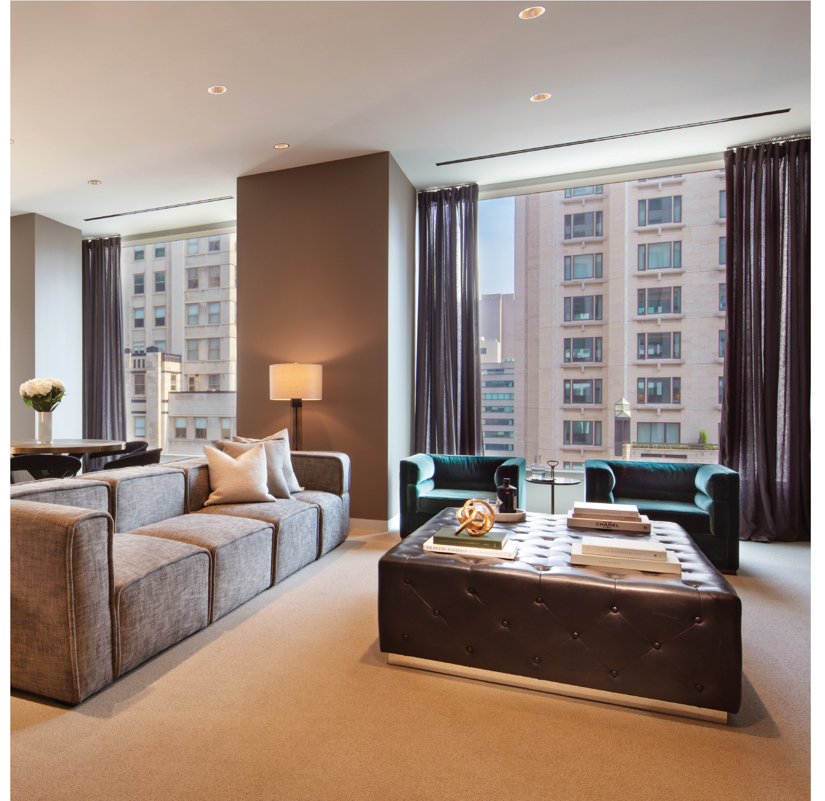
Accessory Suite custom-fitted as private lounge