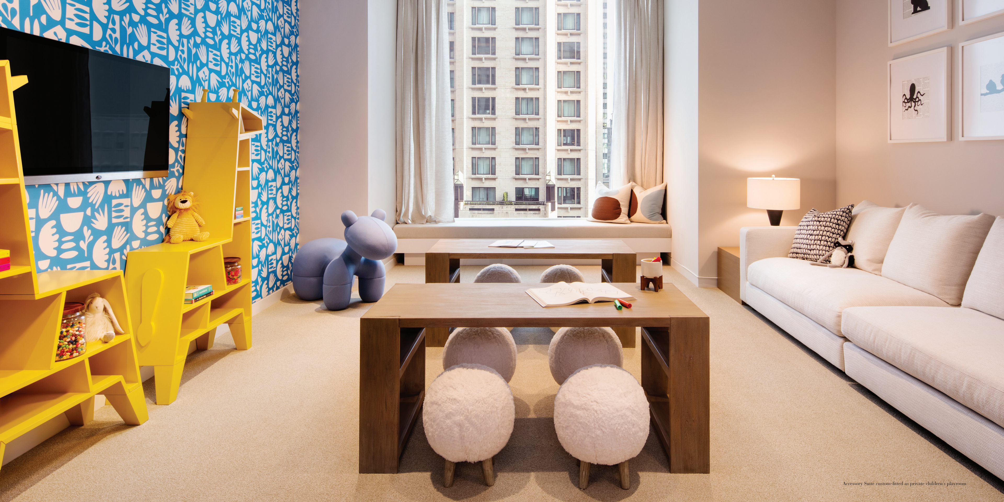
Accessory Suite custom-fitted as private children's playroom