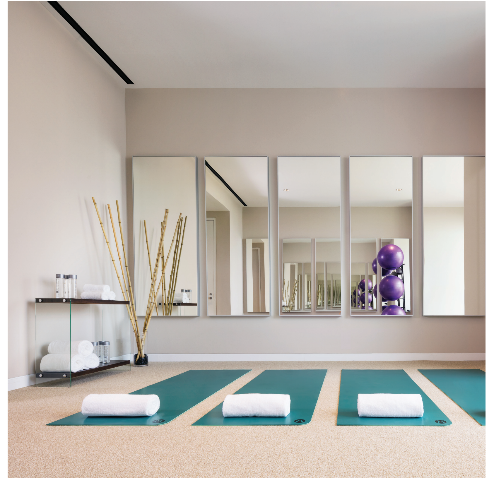
Accessory Suite custom-fitted as private fitness studio